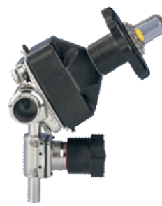
Typical HoseWasher Routing Valves