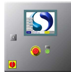
Typical HoseWasher Control Panel