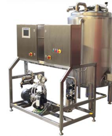
Typical CIPOne™ Cleaning System